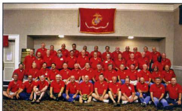
2007 Nashville - 55 Marines, 2 Corpsmen