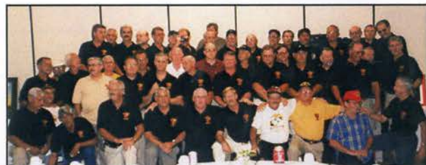
2000 Asheville - 62 Marines, 3 Corpsmen