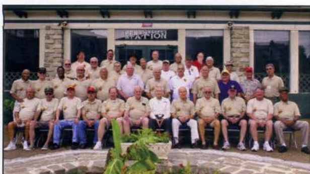
2011 Chattanooga - 35 Marines, 3 Corpsmen