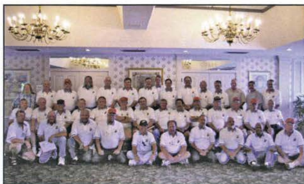
2006 San Diego - 38 Marines, 2 Corpsmen