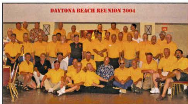
2004 Daytona - 55 Marines