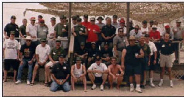
2001 San Diego - 76 Marines, 4 Corpsmen