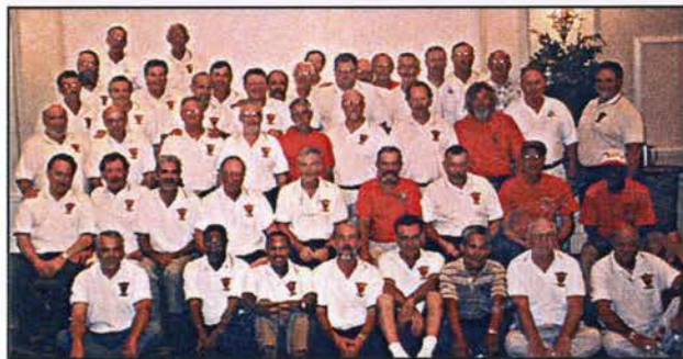
1999 San Antonio - 53 Marines, 1 Corpsman