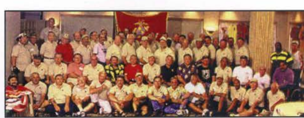
2002 New Orleans - 65 Marines, 1 Corpsman