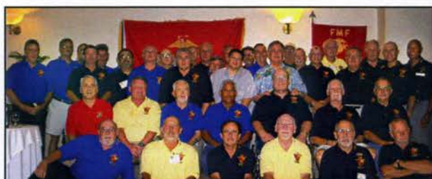
2008 DC - 45 Marines