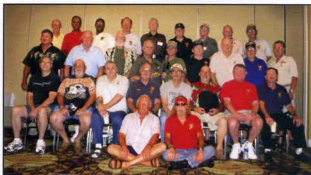
2009 Charleston - 31 Marines