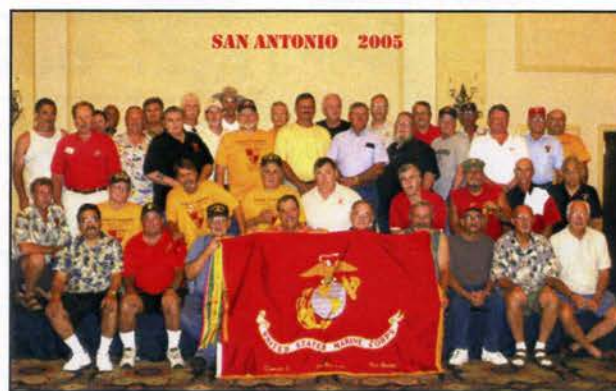
2005 San Antonio - 45 Marines, 1 Corpsman