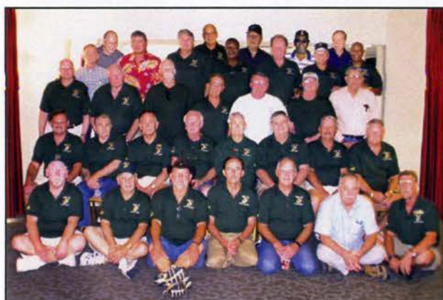
2010 St. Louis - 34 Marines, 3 Corpsmen