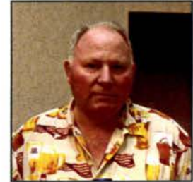
Not Quite Old