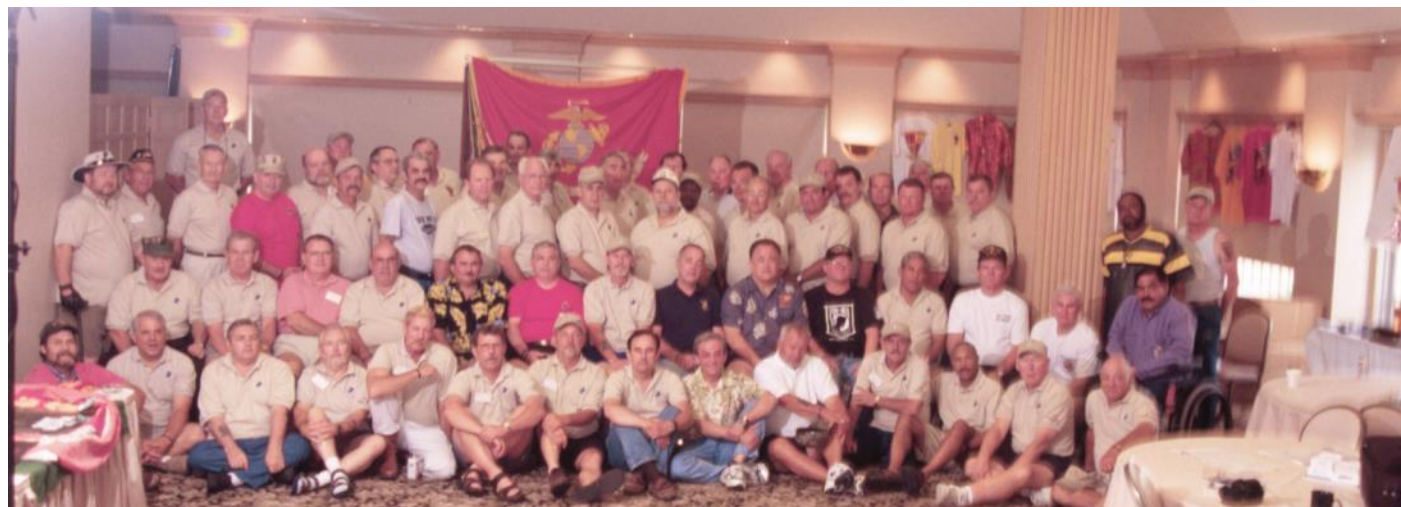
NEW ORLEANS 2002