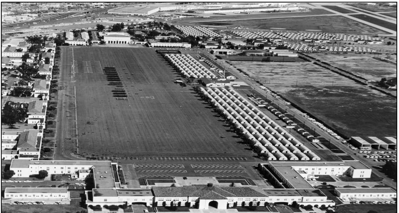
MCRD San Diego 1967